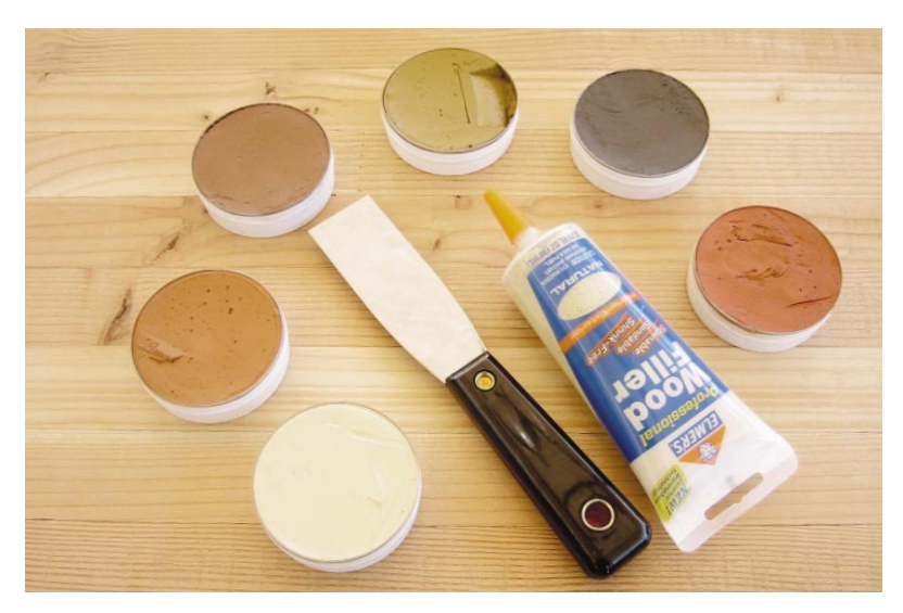
Color fillers enable a close match to the wood grain.

For more information about glulam and the applications where it is used, contact APA – The Engineered Wood Association or visit www.glulambeams.org.